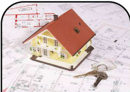
TURN KEY PROJECTS