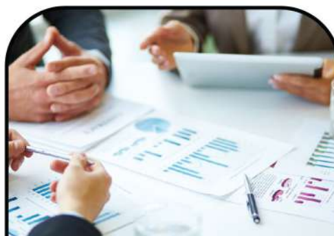
PROJECT MANAGEMENT CONSULTANCY (PMC)